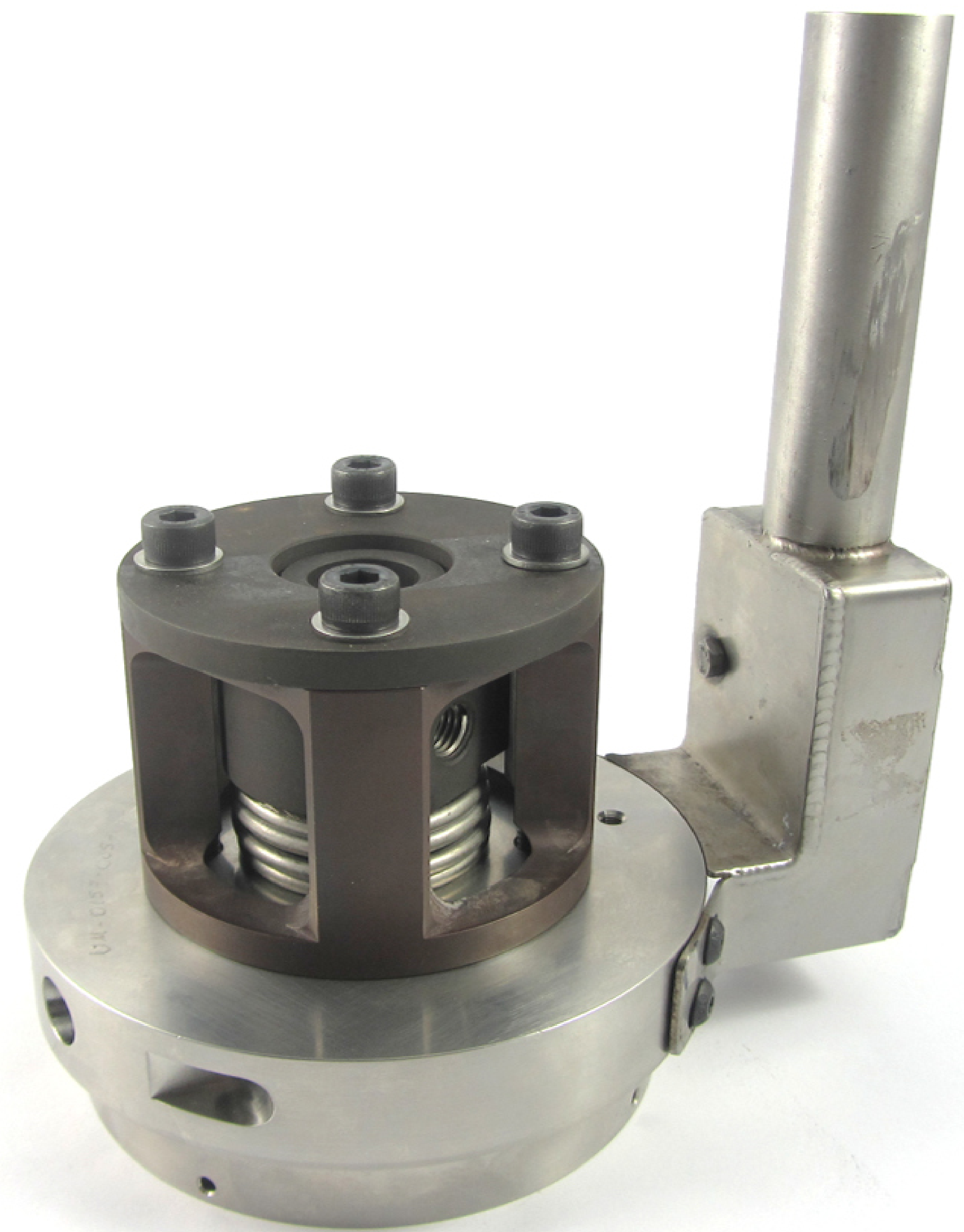
Sealing unit 0157-005-01-00